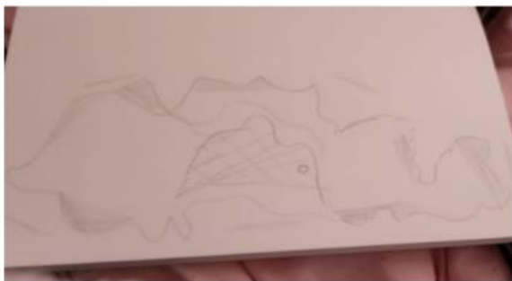
Heydar Aliyev Center