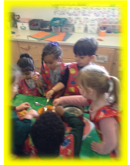
The Nursery Children having fun, exploring and carving pumpkins this week

We will advise you of the focus of the next coffee morning (on Wed 3 rd November) after half term.